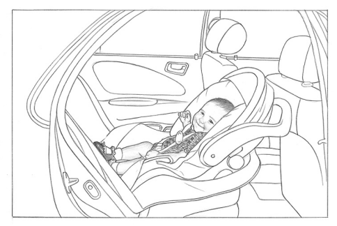
Infant-only car safety seat