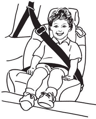
D. Belt-positioning booster seat